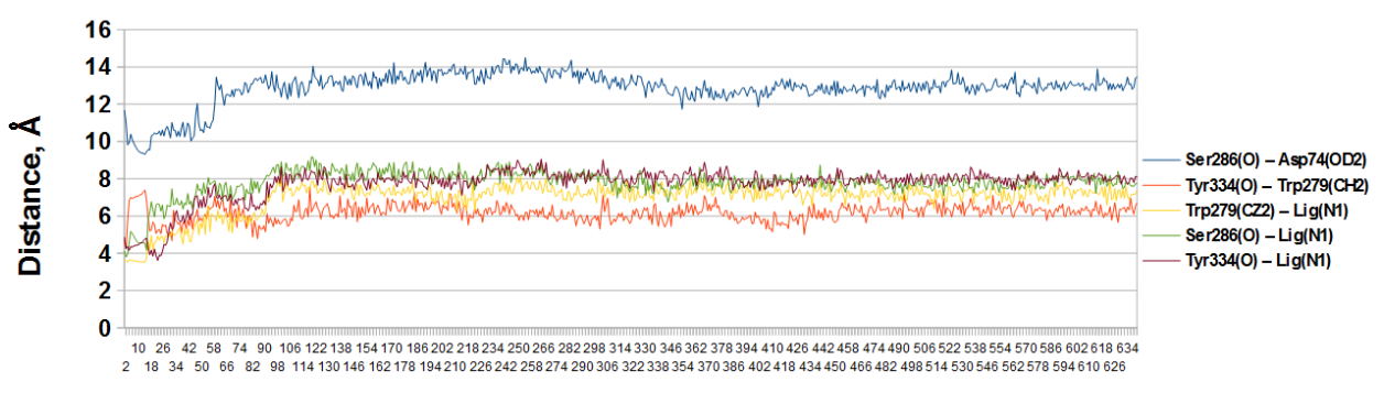
Figure 2: The distance change between the atoms of amino acid residues that form the "gates" in the course of dynamics

2 angstroms. The blue and orange line shows the changes between the atoms, closing the channel "gates" (Figure 1.4 - the black dotted lines).